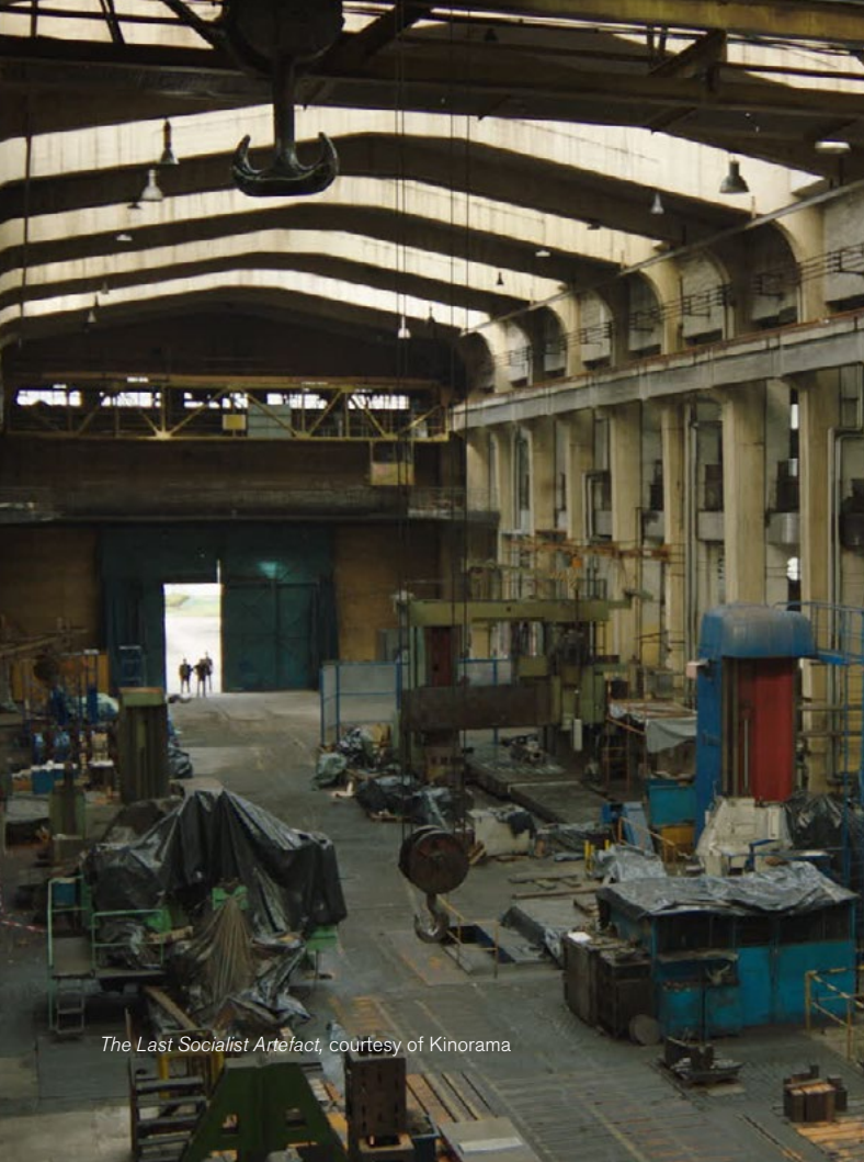
The Last Socialist Artefact