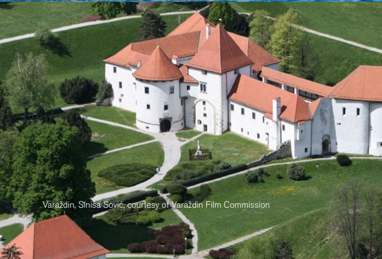
Varaždin, Siniša Sović, courtesy of Varaždin Film Commission