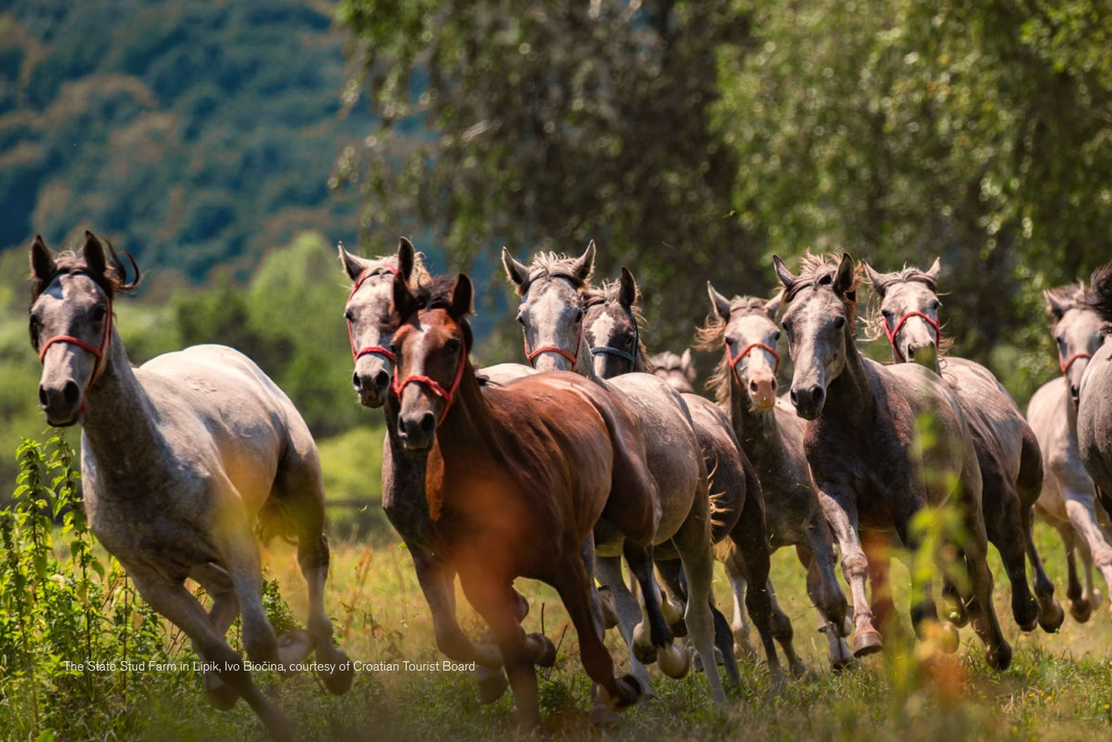
The State Stud Farm in Lipik