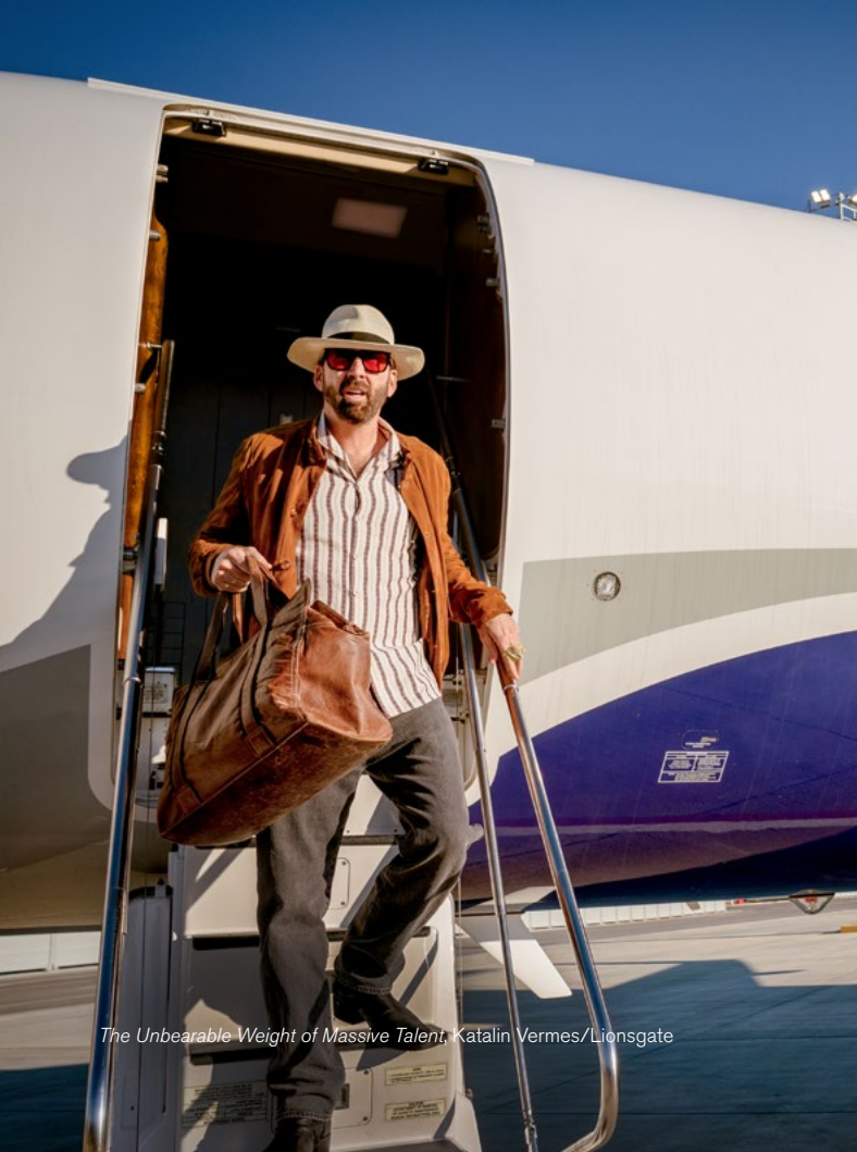
The Unbearable Weight of Massive Talent