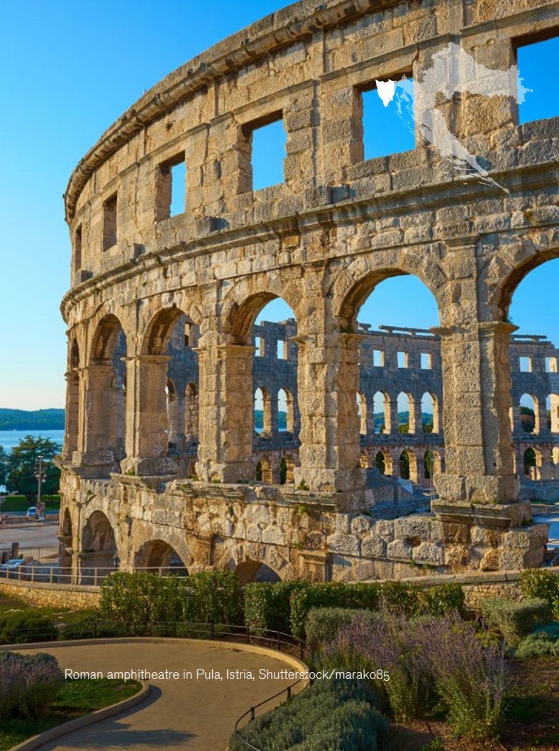
Roman amphitheatre in Pula, Istria