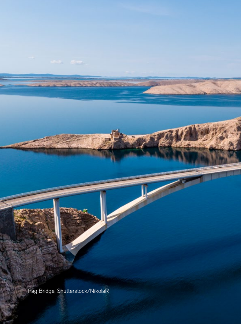
Pag Bridge, Shutterstock/NikolaR