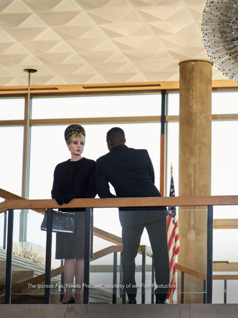
The Ipccress File , Nikola Predović, courtesy of MP-Film Production