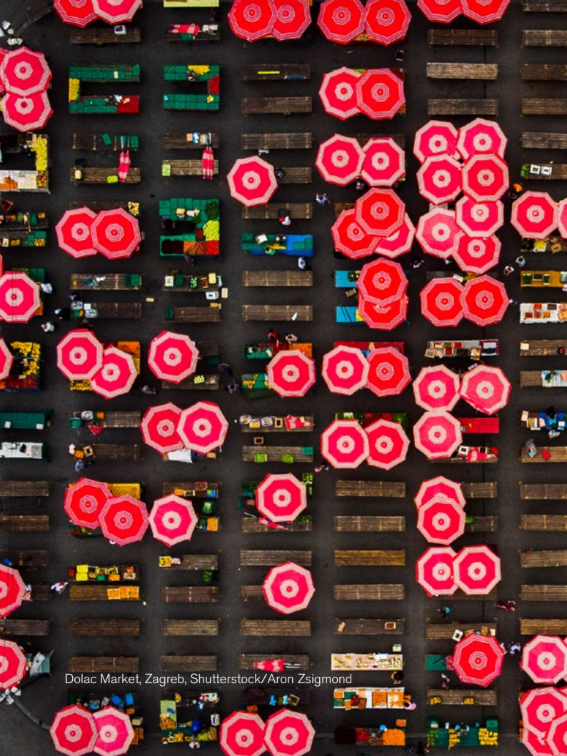
Dolac Market, Zagreb