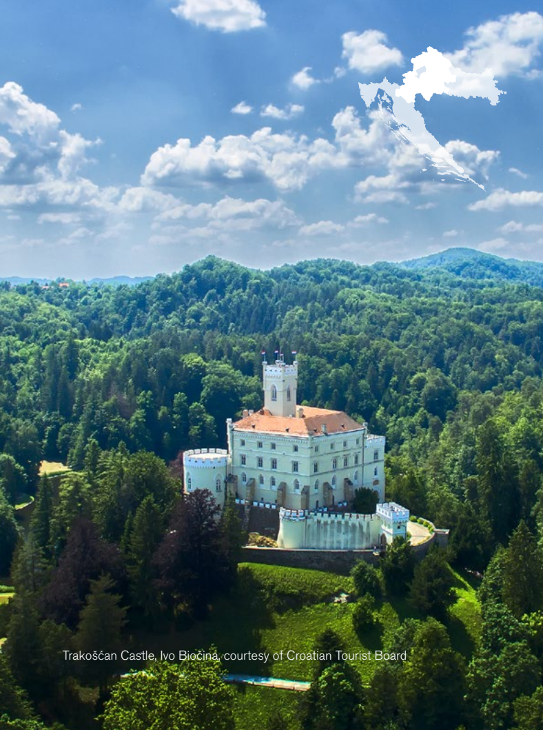
Trakošćan Castle