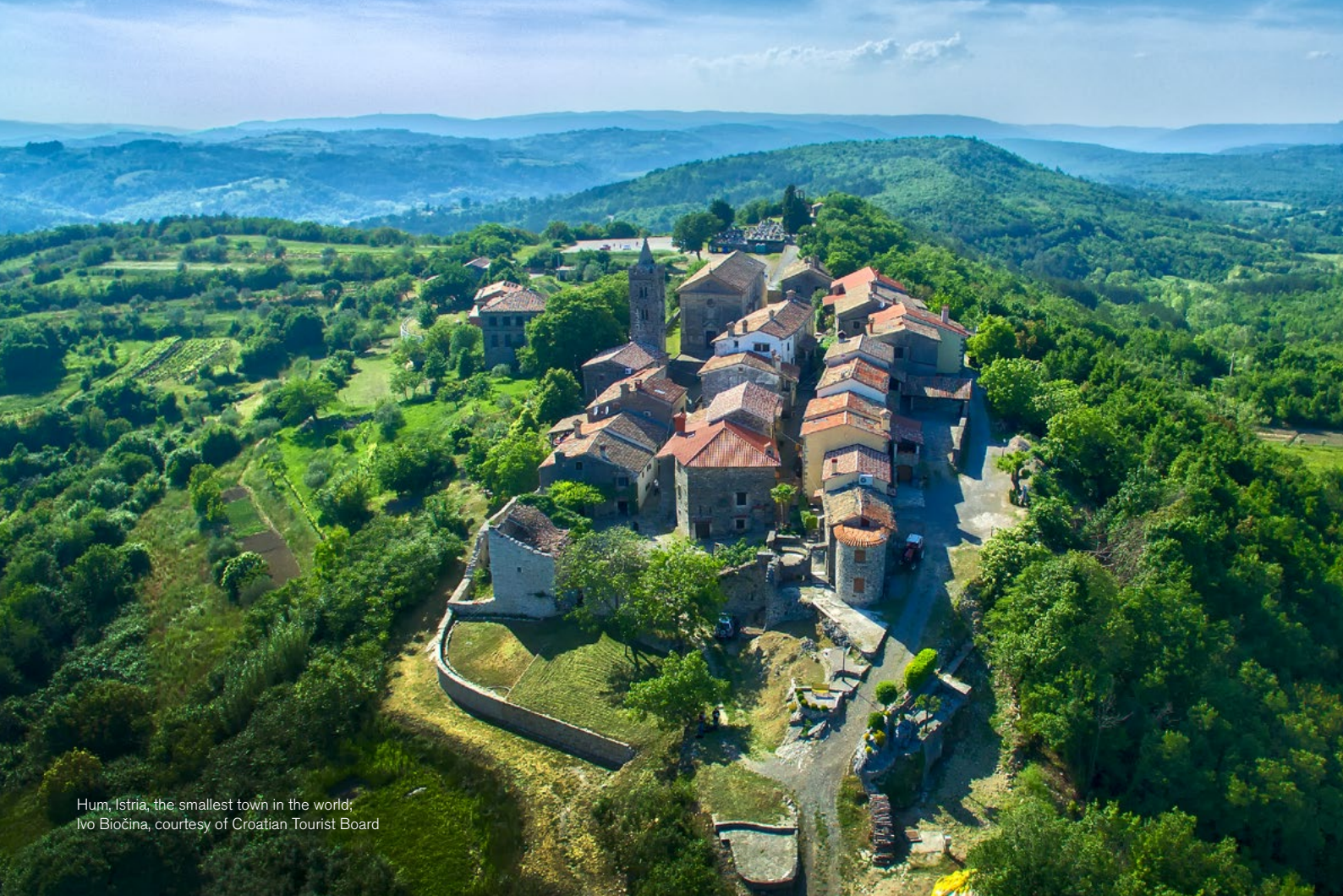
Hum, Istria, the smallest town in the world