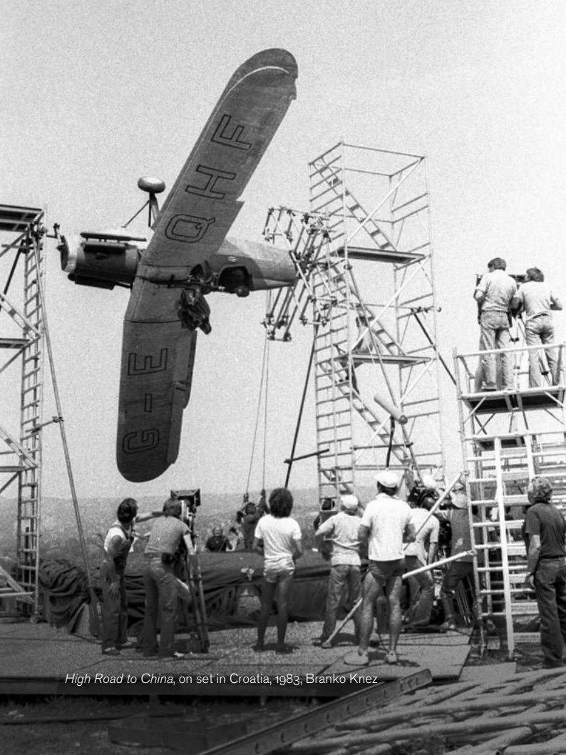
High Road to China , on set in Croatia, 1983; Branko Knez