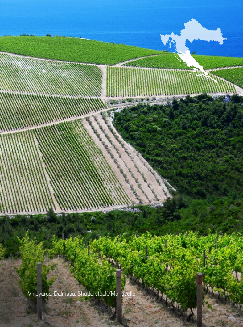
Vineyards, Dalmatia