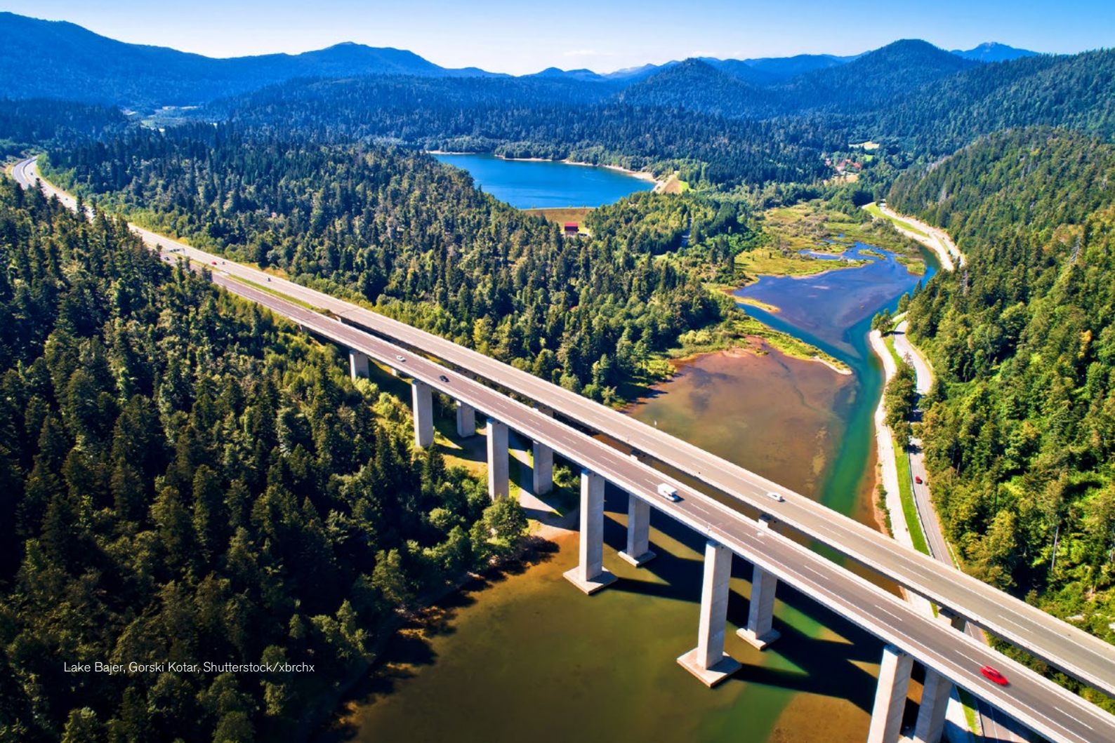
Lake Bajer, Gorski Kotar