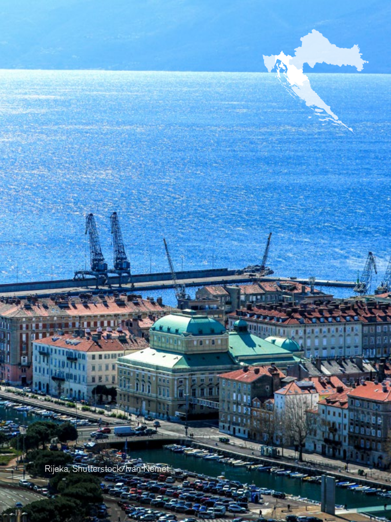
Rijeka, Shutterstock/Ivan Nemet