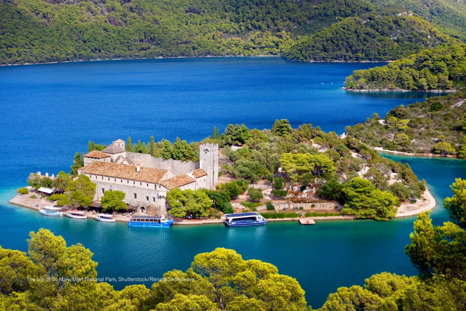
The Isle of St. Mary, Mljet National Park