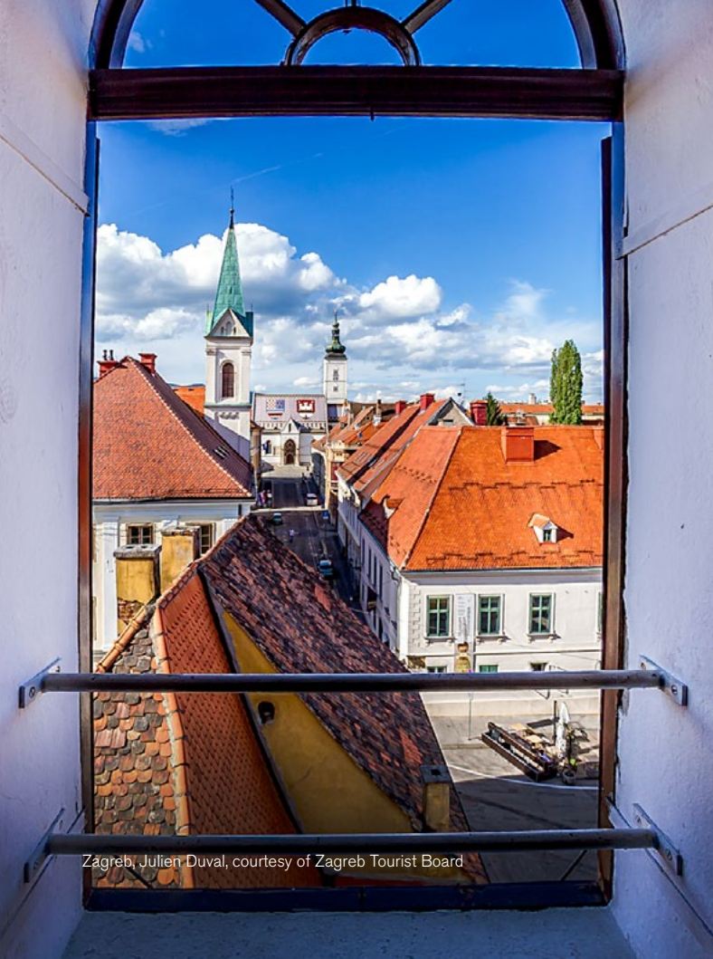
Zagreb, Julien Duval, courtesy of Zagreb Tourist Board

Zagreb offers a wide range of accommodation options and has excellent air, road and train connections to other European and non-European cities. In addition to the Zagreb International Airport, only 17 km away from the city centre, a new network of motorways connects Zagreb to Italy, Austria, Slovenia and Hungary.