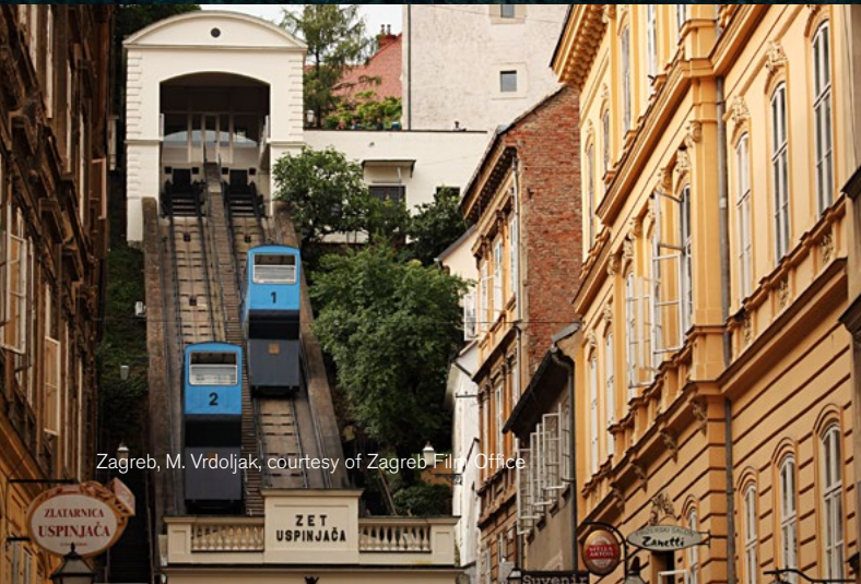
Zagreb, M. Vrdoljak, courtesy of Zagreb Film Office