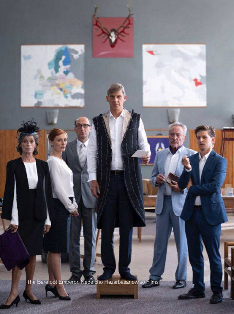
The Barefoot Emperor, Nedelcho Hazarbasanov/Bo Films

Productions benefiting from more than HRK 5 million (approximately EUR 666,000), have to employ at least one Croatian trainee in each of the main production departments.