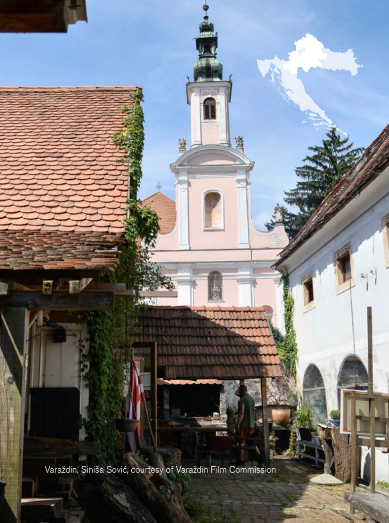
Varaždin, Siniša Sović, courtesy of Varaždin Film Commission