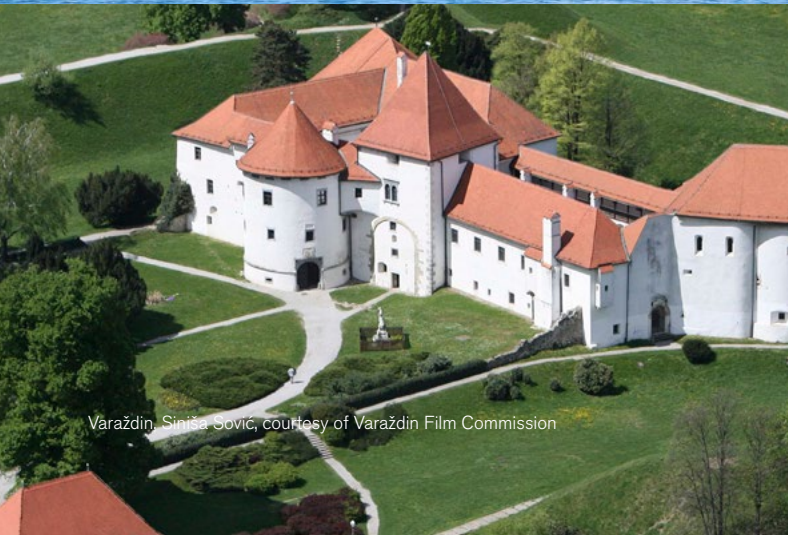
Varaždin, Siniša Sović, courtesy of Varaždin Film Commission