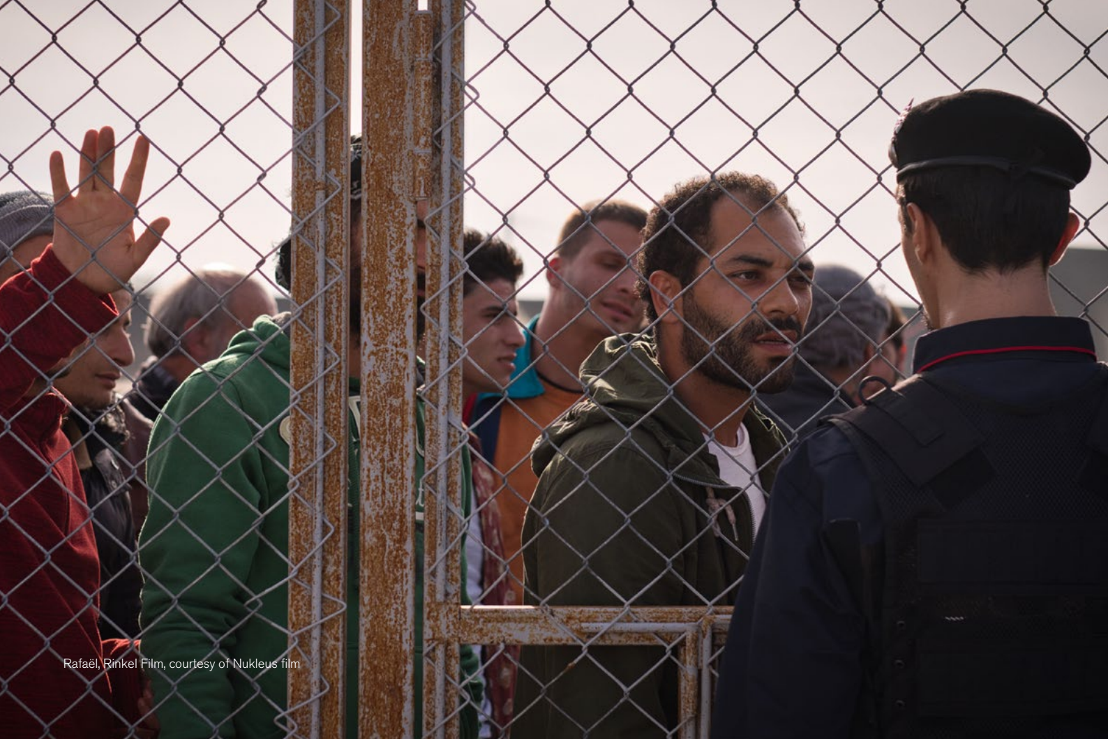
Rafaël, Rinkel Film, courtesy of Nukleus film