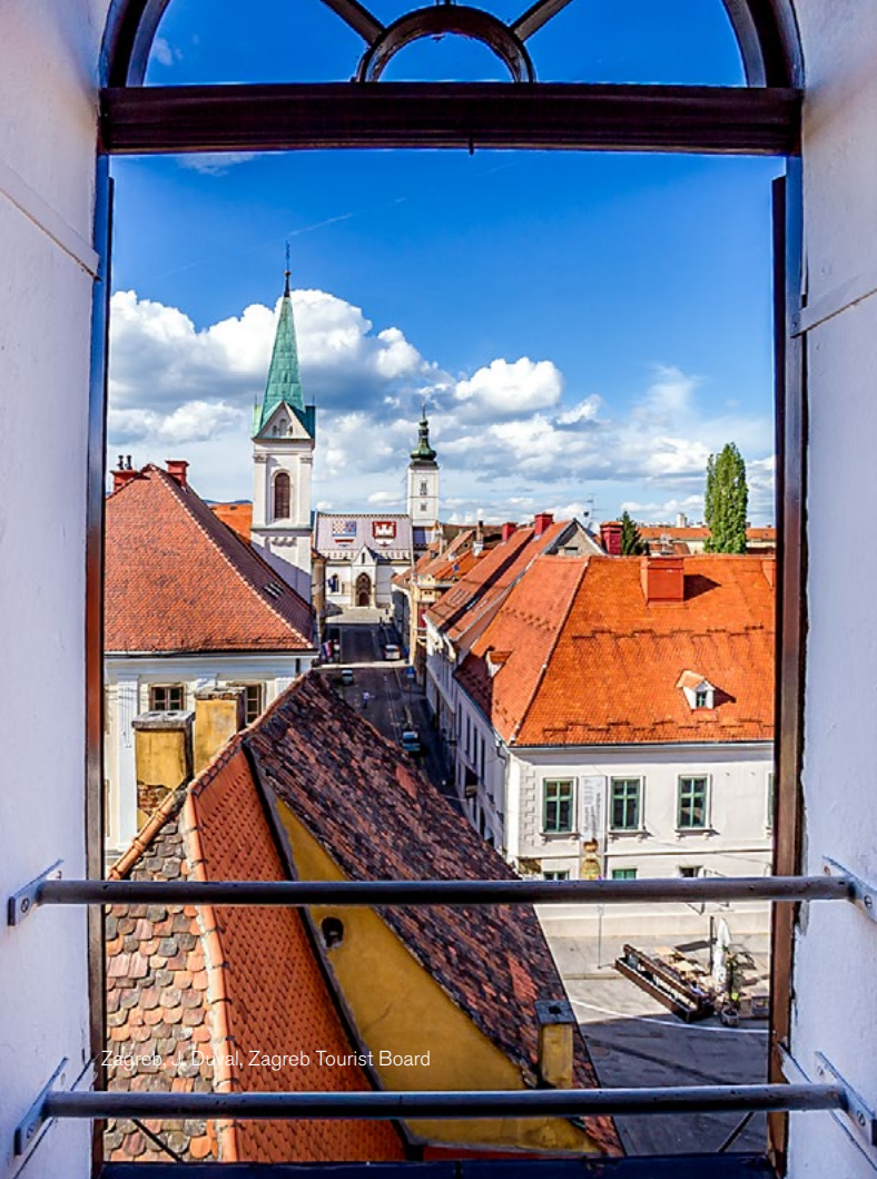
Zagreb - Duval, Zagreb Tourist Board