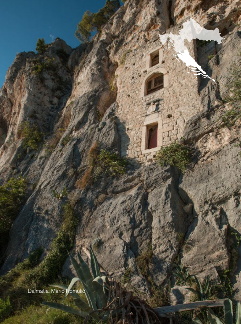
Dalmatia