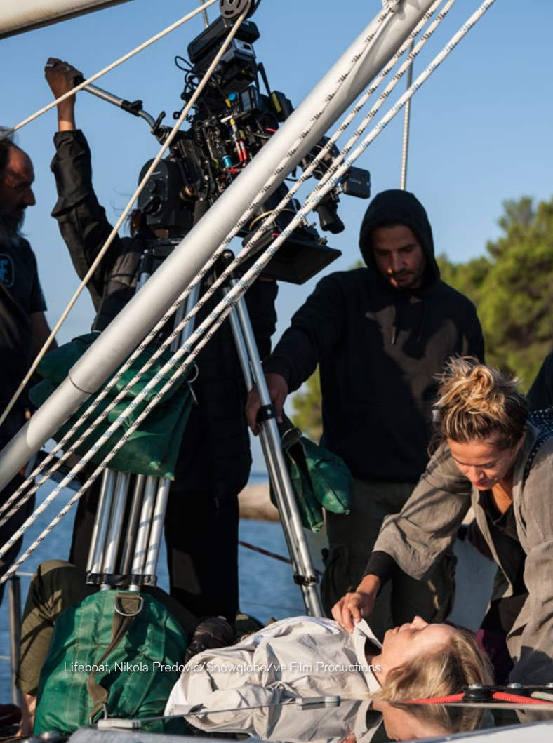
Lifeboat, Nikola Predovic/Snowglobe/MF Film Productions