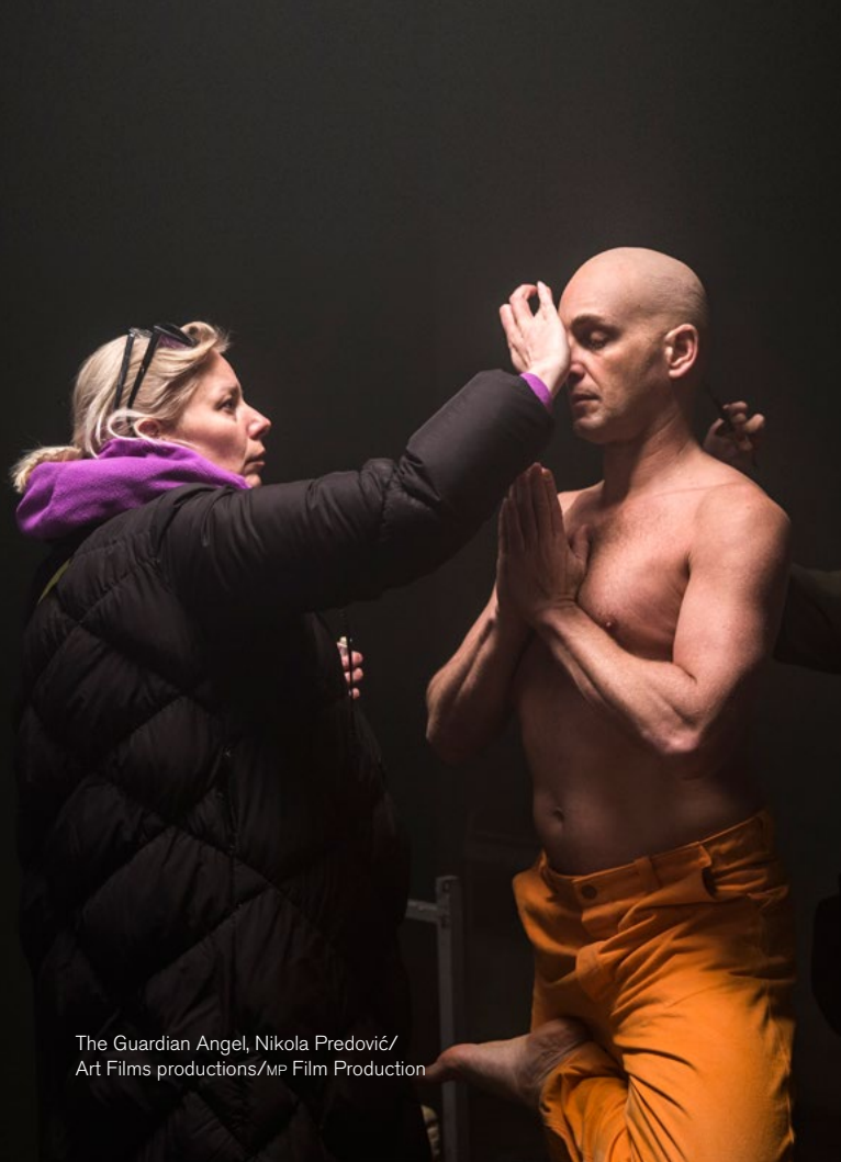
The Guardian Angel, Nikola Predović/ Art Films productions/MIP Film Production