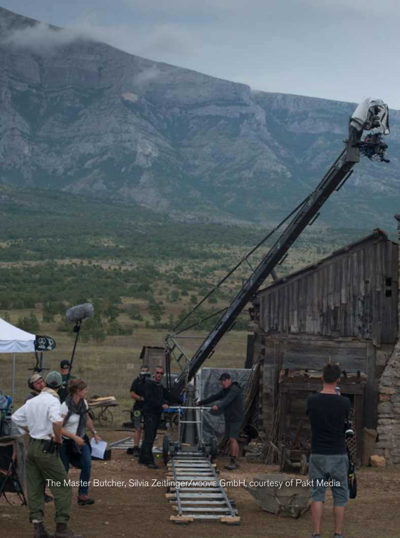
The Master Butcher