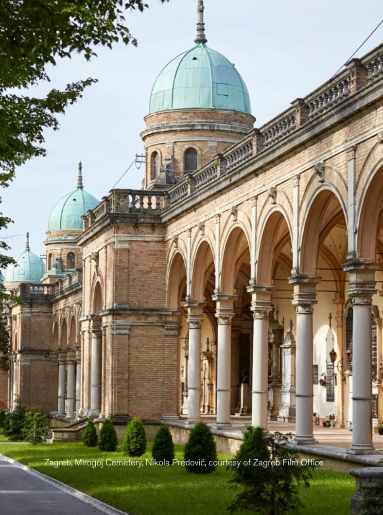
Zagreb, Mirogoj Cemetery, Nikola Predović, courtesy of Zagreb Film Office

Zagreb offers a wide range of accommodation options and has excellent air, road and train connections to other European and non-European cities. In addition to the Zagreb International Airport, only 17 km away from the city centre, a new network of motorways connects Zagreb to Italy, Austria, Slovenia and Hungary.