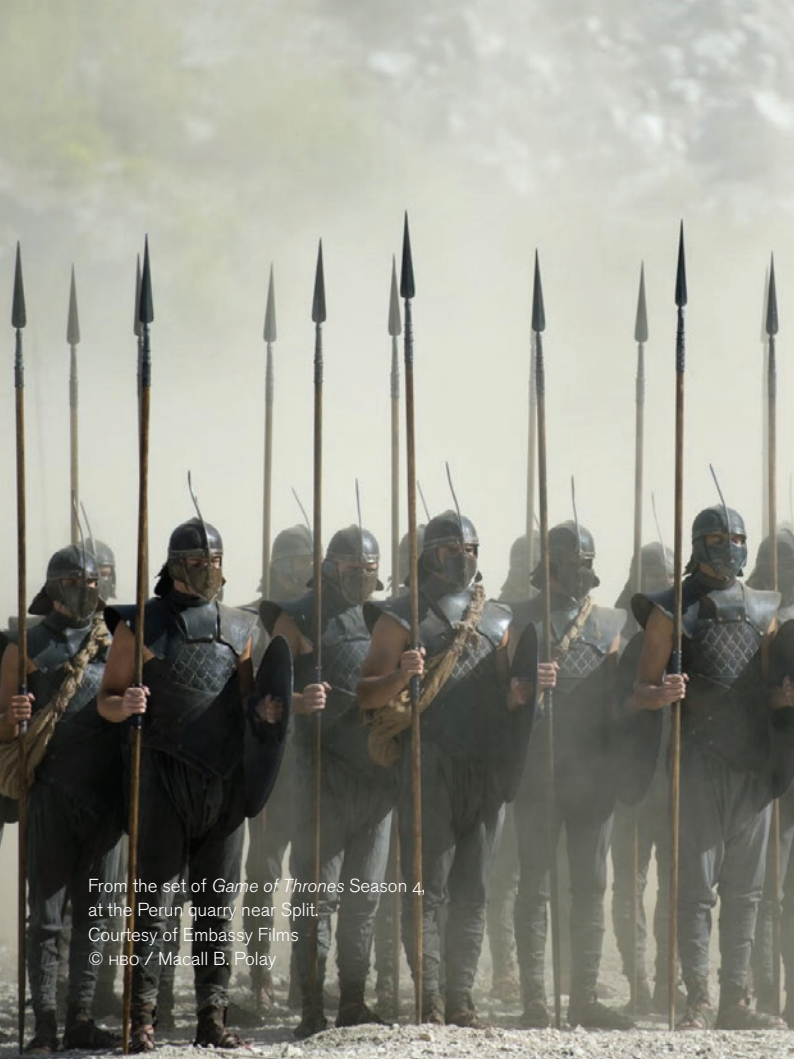
From the set of Game of Thrones Season 4, at the Perun quarry near Split.