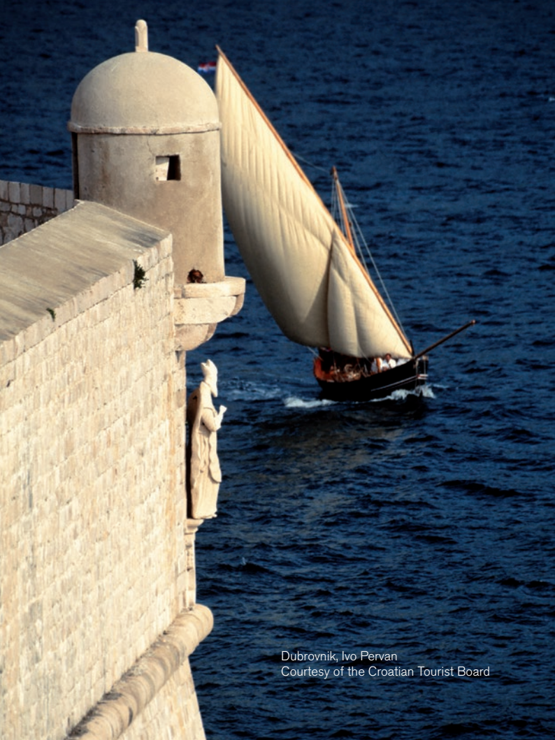
Dubrovnik, Ivo Pervan Courtesy of the Croatian Tourist Board