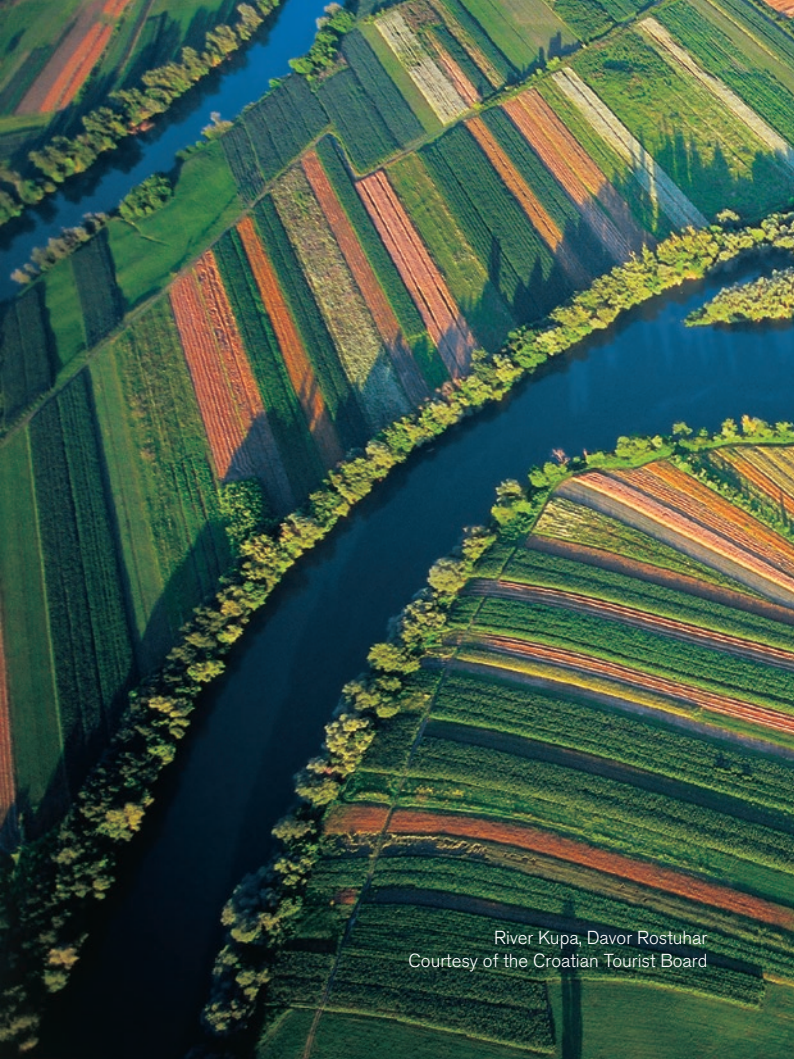
River Kupa, Davor Rostuhar Courtesy of the Croatian Tourist Board