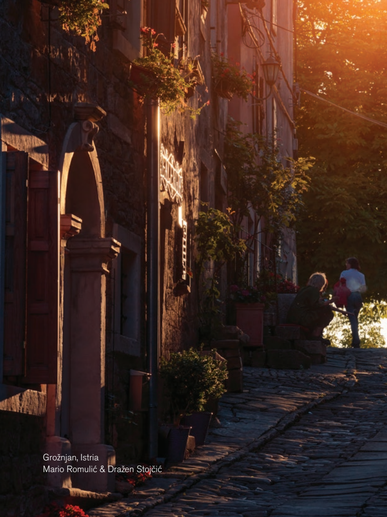
Grožnjan, Istria