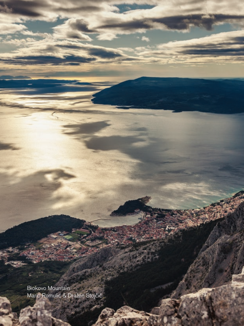
Biokovo Mountain