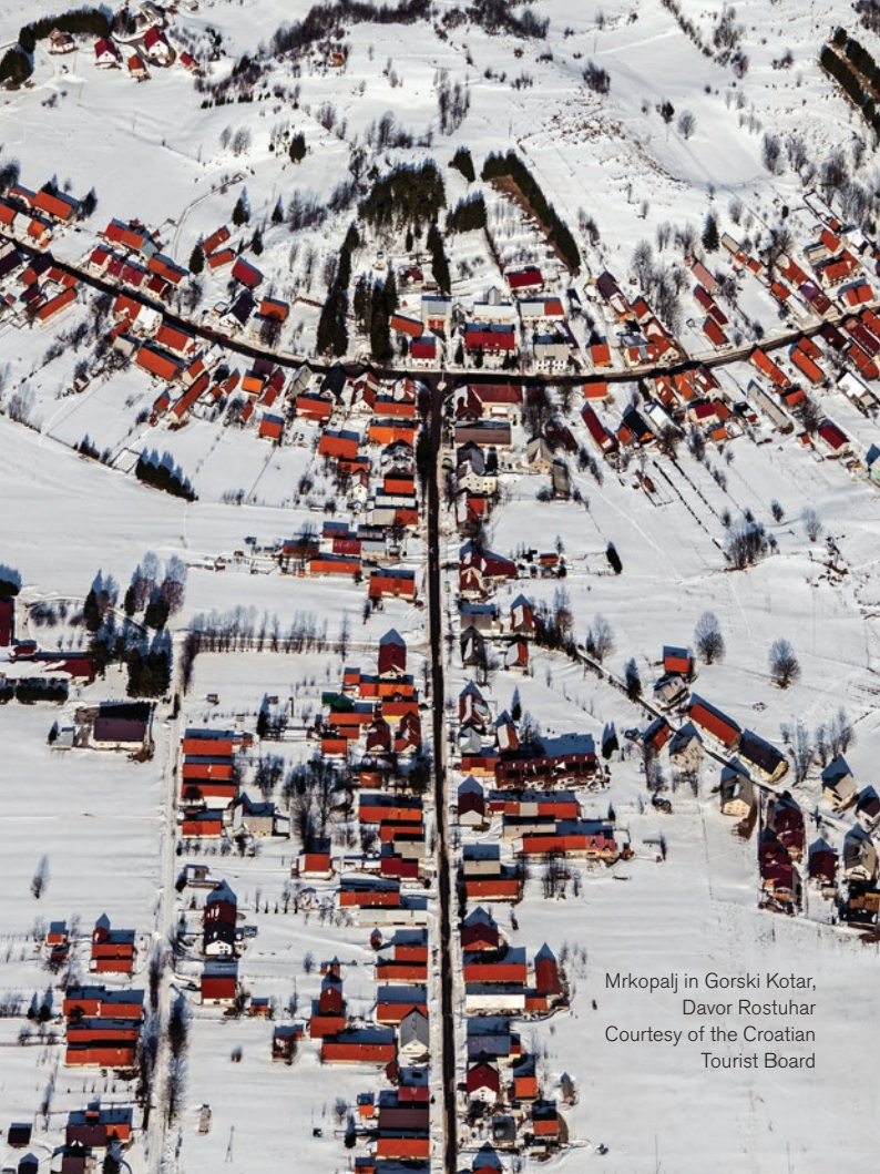
Mrkopalj in Gorski Kotar