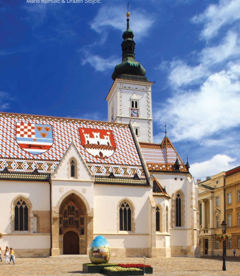
Zagreb, the Church of St. Mark