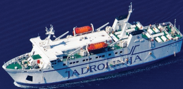
Jadrolinija ferry Mario Romulić & Dražen Stojčić