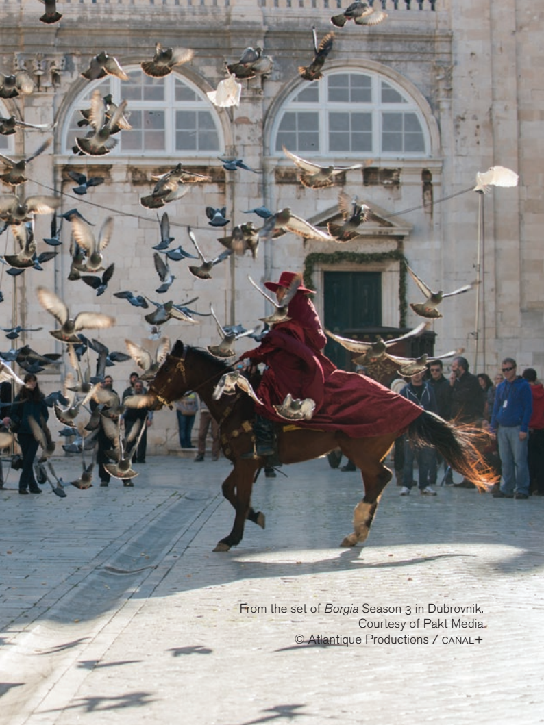
From the set of Borgia Season 3 in Dubrovnik.