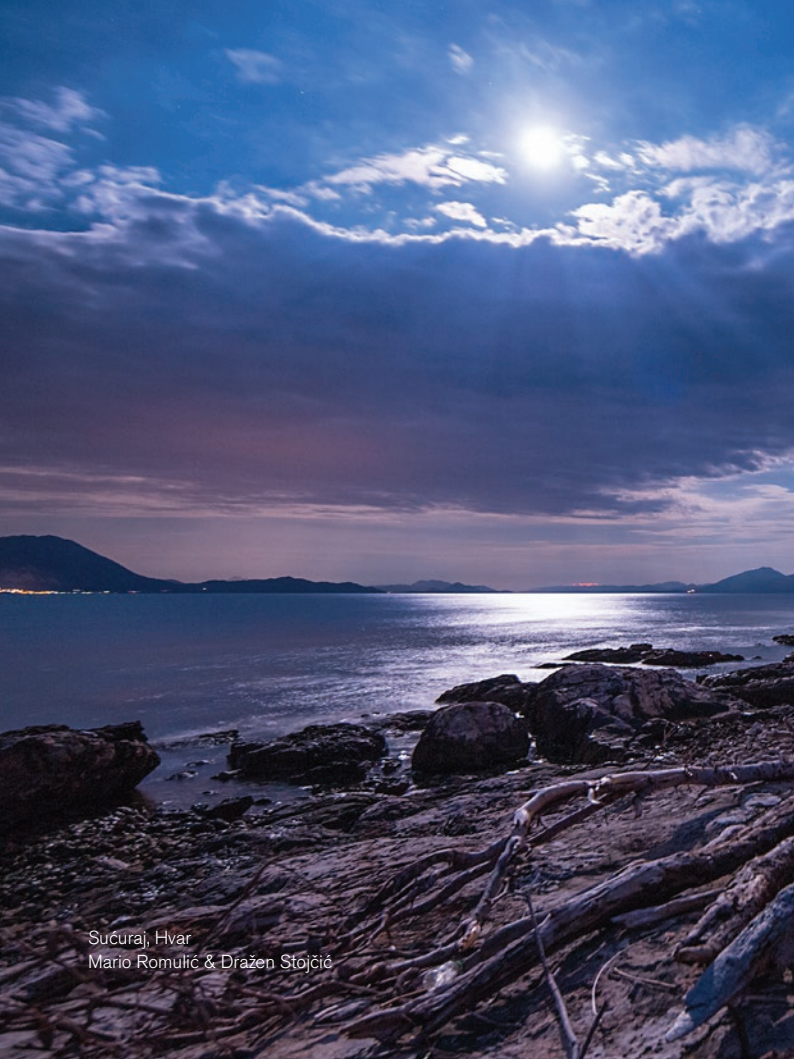
Sućuraj, Hvar