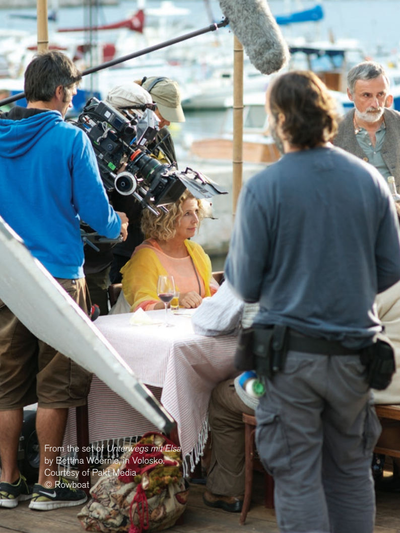
From the set of Unterwegs mit Elsa by Bettina Woernle, in Volosko.