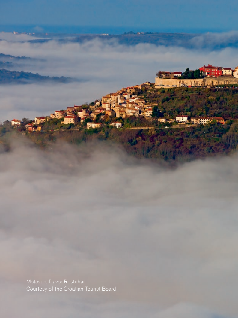
Motovun, Davor Rostuhar Courtesy of the Croatian Tourist Board