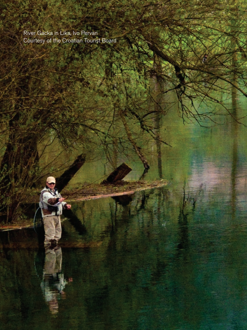
River Gacka in Lika, Ivo Pervan Courtesy of the Croatian Tourist Board