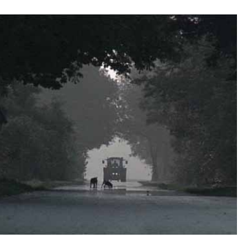
Pustara | Wasteland 2010 | 26' | DigiBeta DIRECTED BY Ivan Faktor The main 'characters' in the film are light and, most importantly, silence - because in the wasteland, on that 'island' with no visible boundaries between the sky and the earth, in that prison with no fences, silence is louder than the noise of any city.