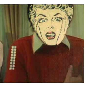
Pain So Light That Appears As Tickle 2010 | 4'04" | DigiBeta DIRECTED BY Dalibor Barić Pain is slowed down in slow motion up to the sensitivity threshold and is sold as an everyday anesthetic.