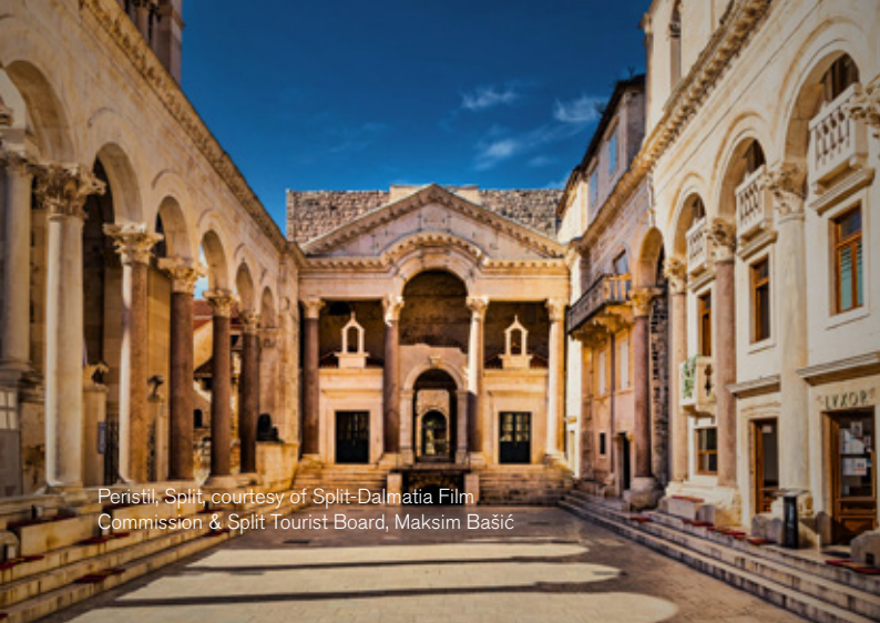
Peristil, Split, courtesy of Split-Dalmatia Film Commission & Split Tourist Board, Maksim Bašić