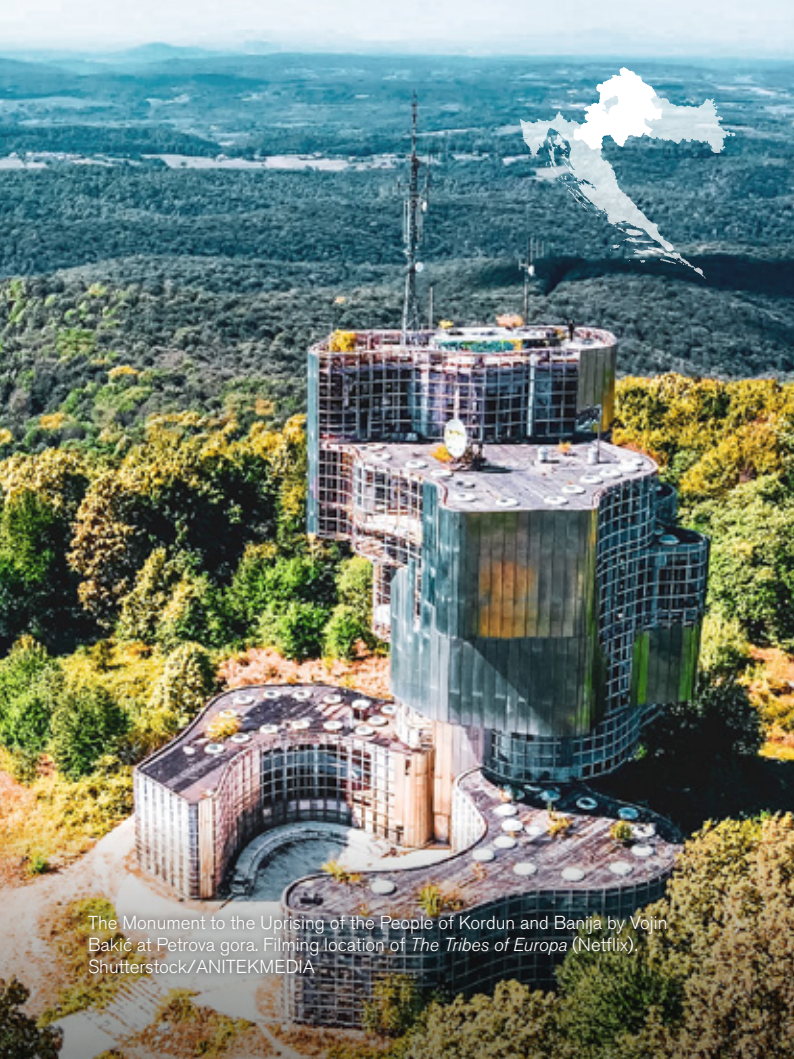
The Monument to the Uprising of the People of Kordun and Banija by Vojin Bakić at Petrova gora. Filming location of The Tribes of Europa (Netflix).