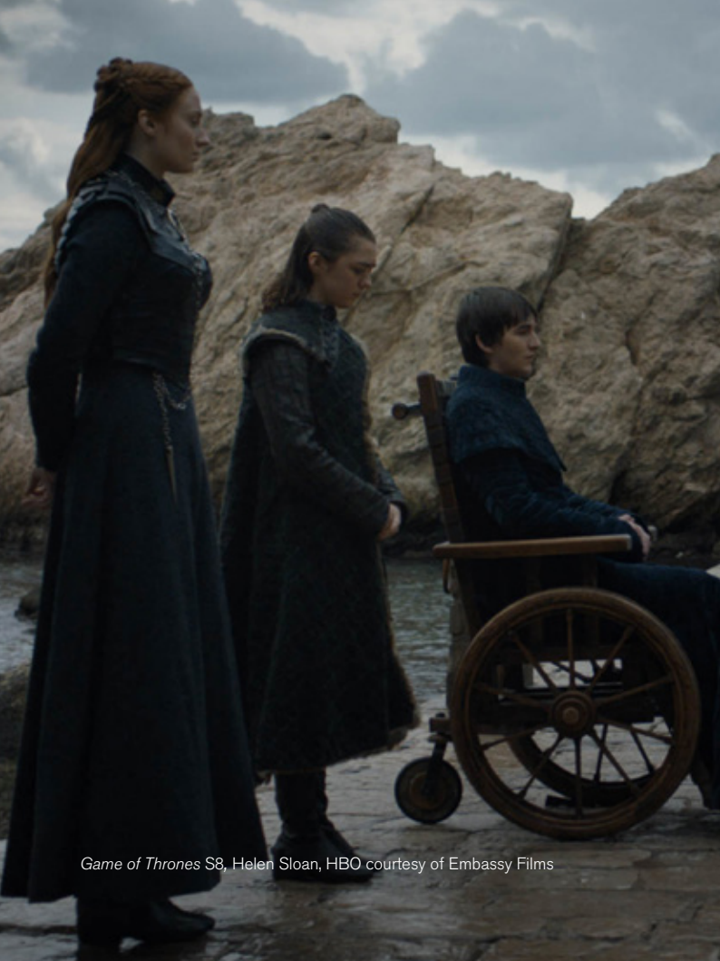
Game of Thrones S8