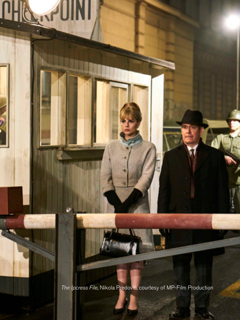
The Ipcress File , Nikola Predović, courtesy of MP-Film Production