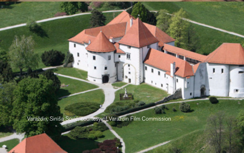
Varaždin, Siniša Sović, courtesy of Varaždin Film Commission