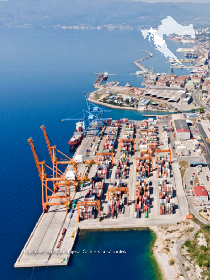
Container terminal in Rijeka