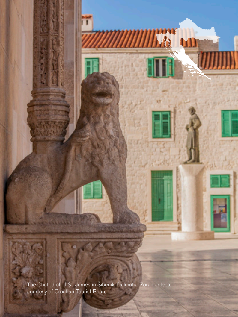
The Chatedral of St. James in Šibenik, Dalmatia