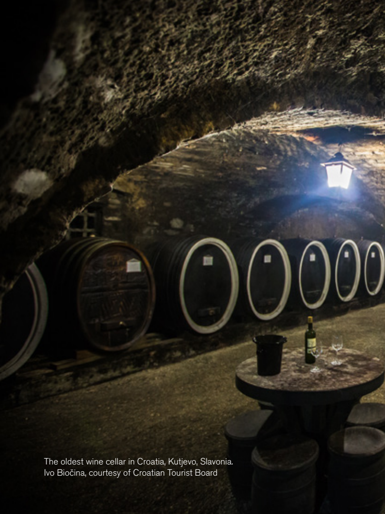
The oldest wine cellar in Croatia, Kutjevo, Slavonia.