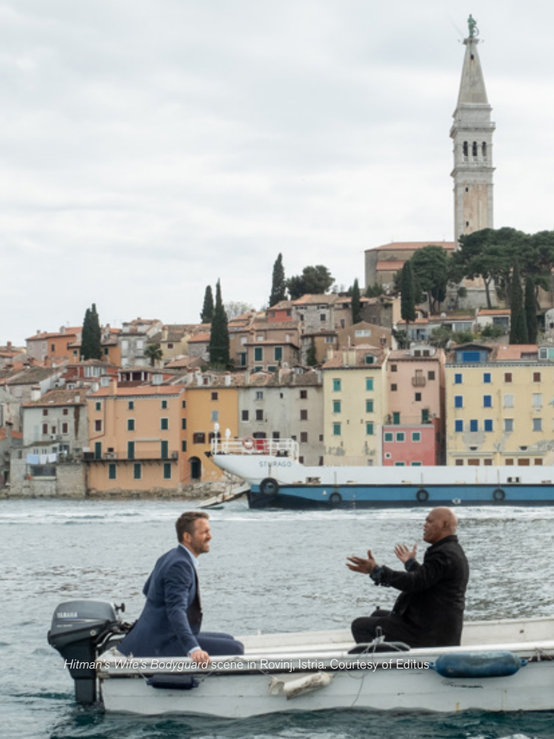
Hitman's Wife's Bodyguard scene in Rovinj, Istria.