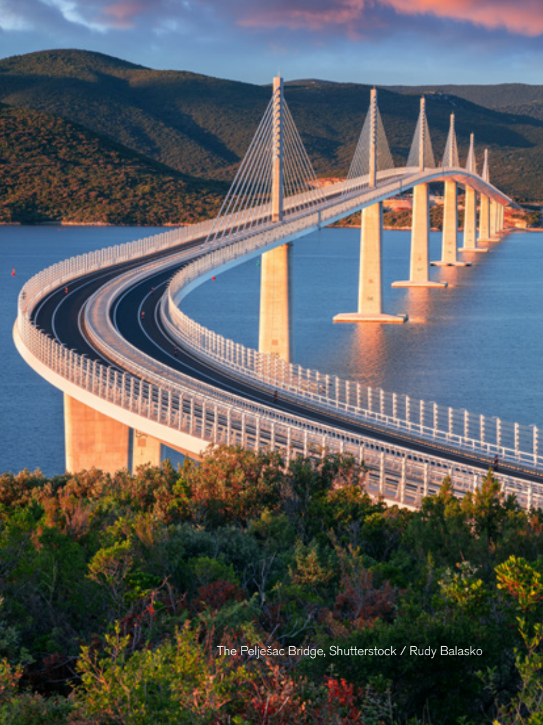
The Pelješac Bridge