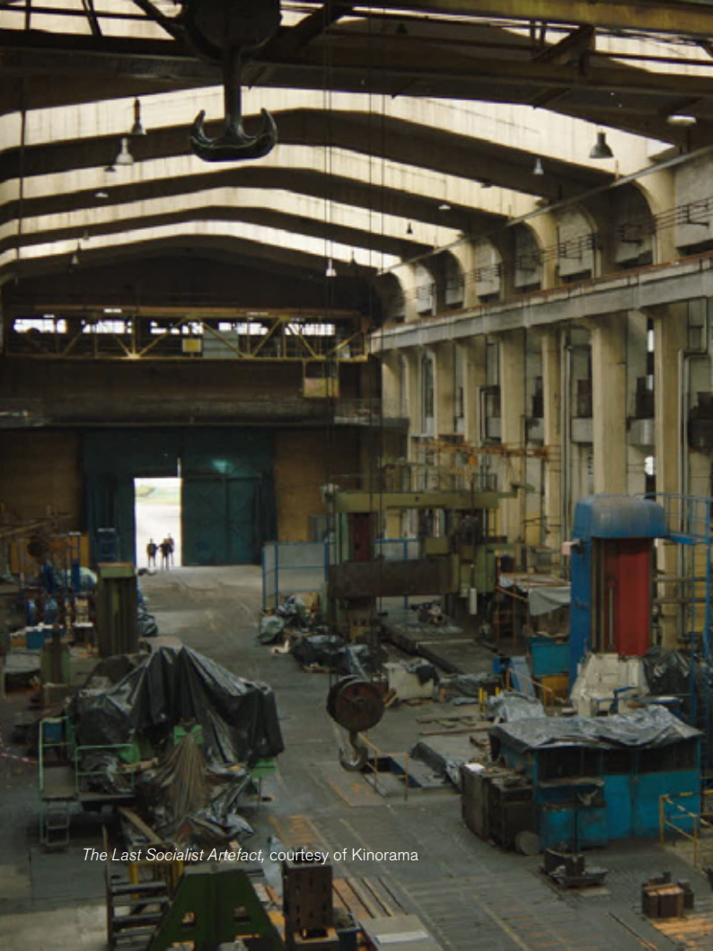
The Last Socialist Artefact