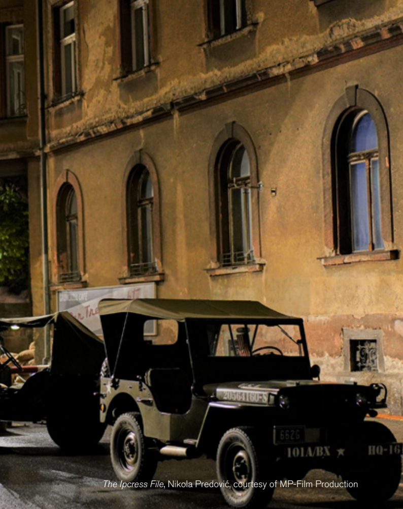
The Ipress File, Nikola Predović, courtesy of MP-Film Production