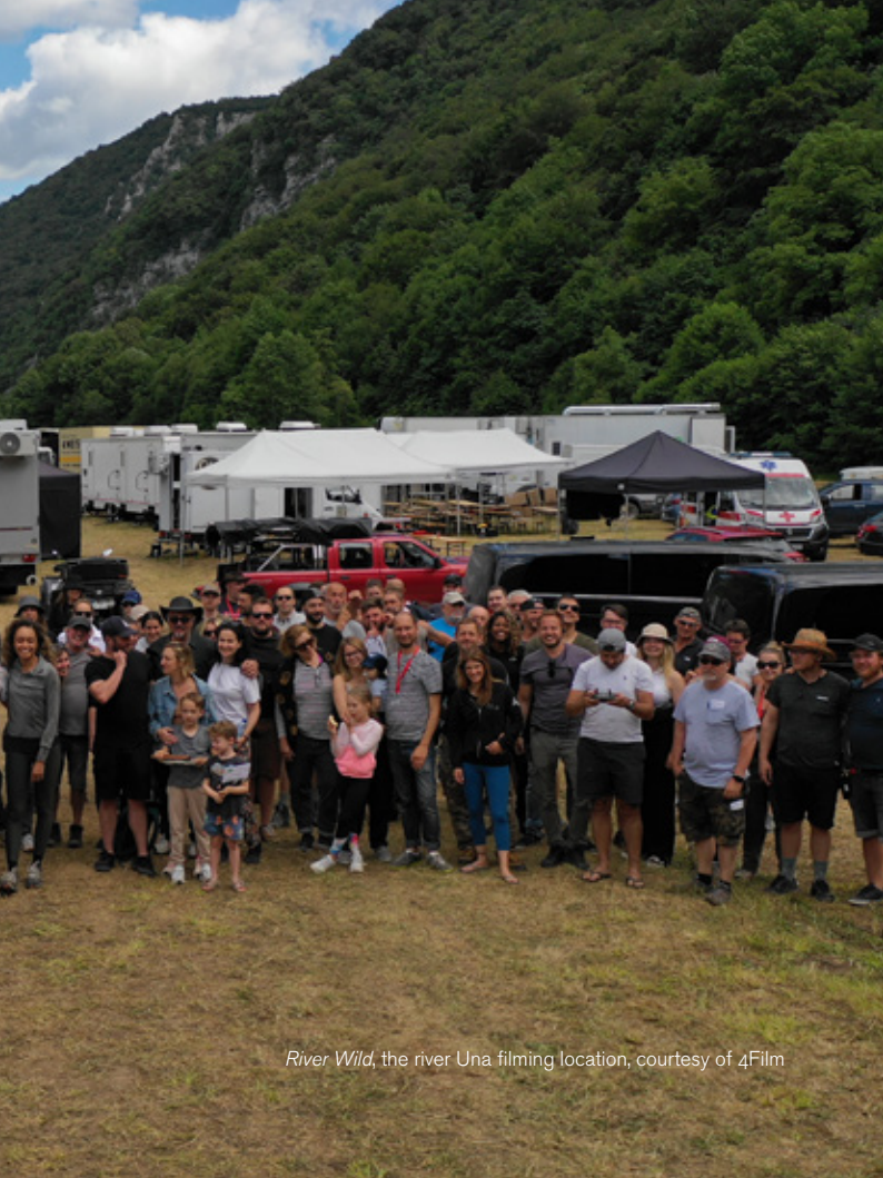
River Wild , the river Una filming location, courtesy of 4Film