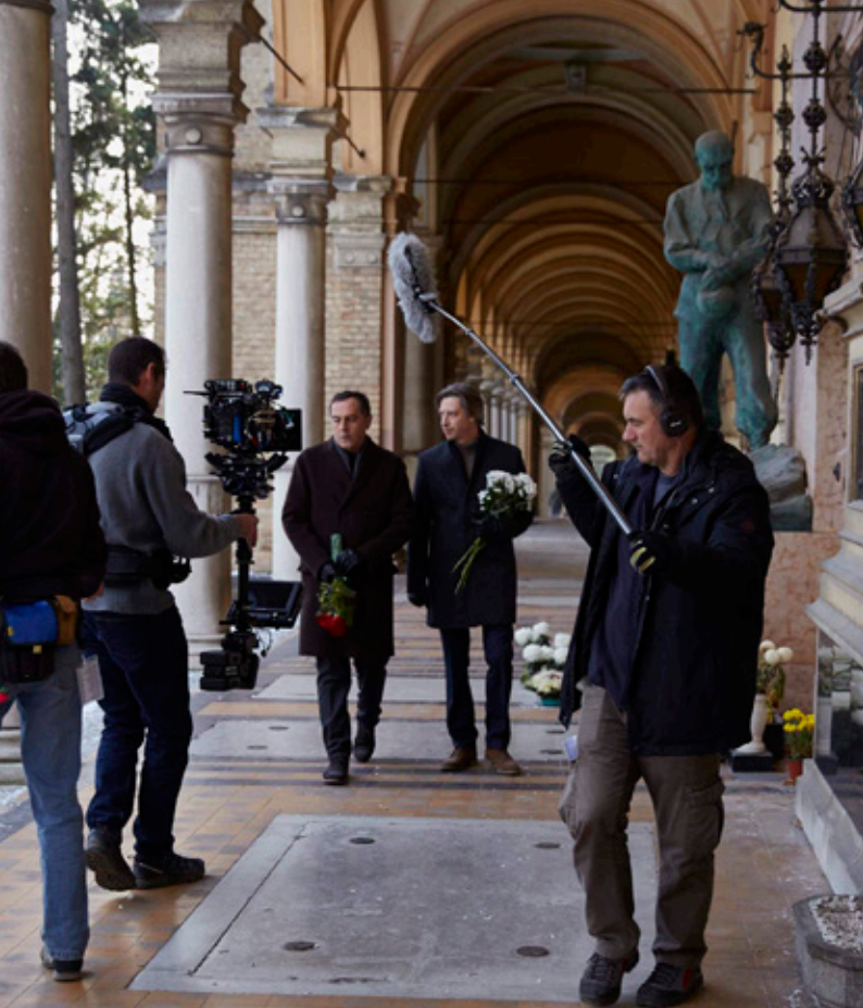
McMafia set at the Mirogoj cemetery in Zagreb.