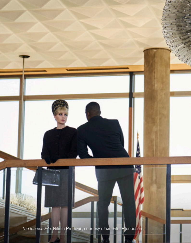
The Ipcress File , Nikola Predović, courtesy of MP-Film Production