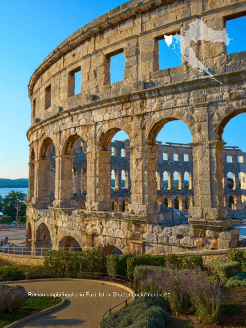
Roman amphitheatre in Pula, Istria, Shutterstock/marako85