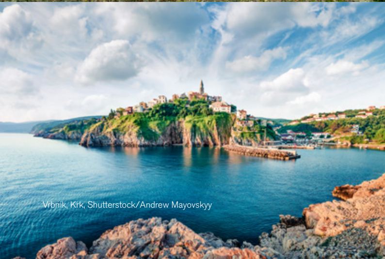
Vrbnik, Krk