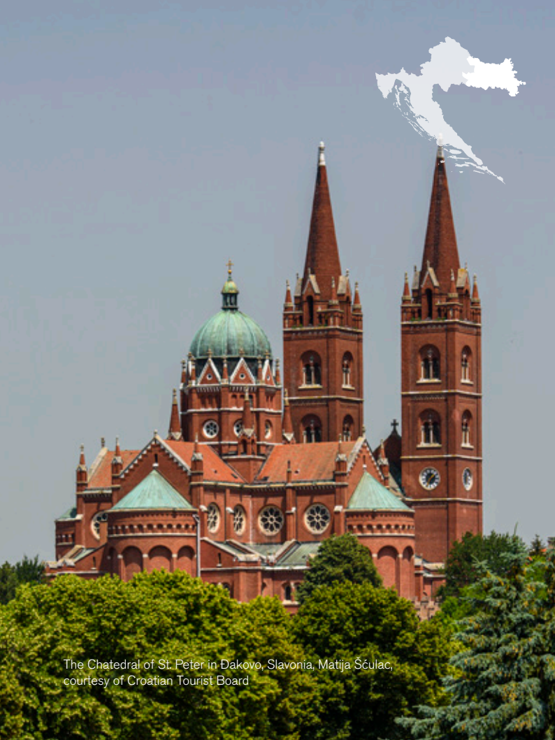
The Chatedral of St. Peter in Đakovo, Slavonia, Matija Šćulac, courtesy of Croatian Tourist Board