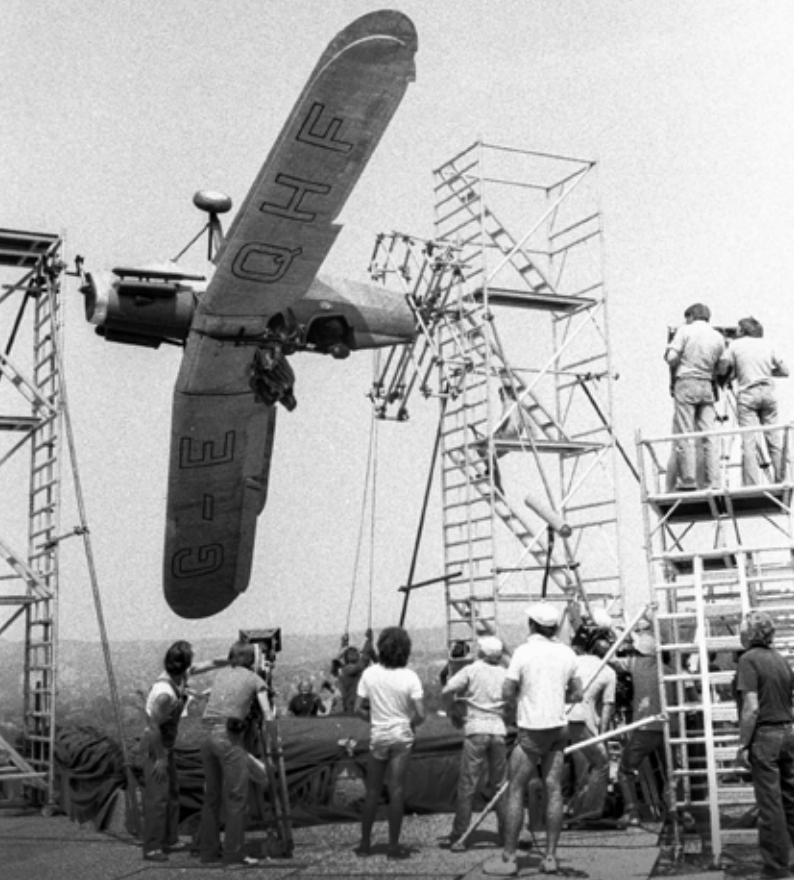
High Road to China, on set in Croatia, 1983, Branko Knez