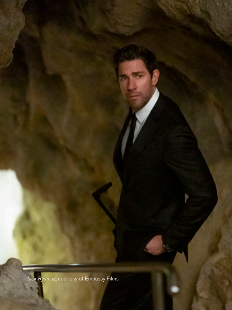
Jack Ryan s4